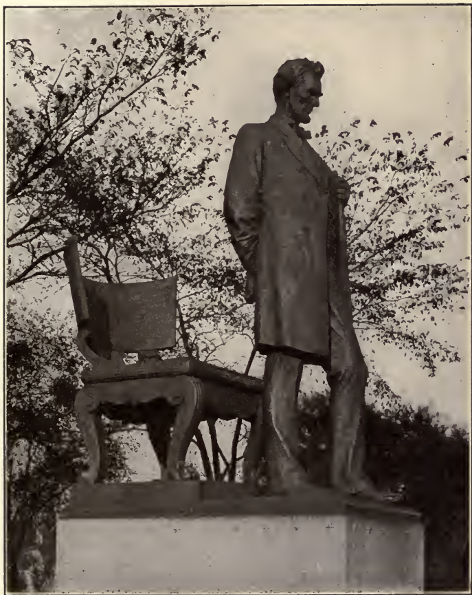
Lincoln Statue, by St. Gaudens, Chicago